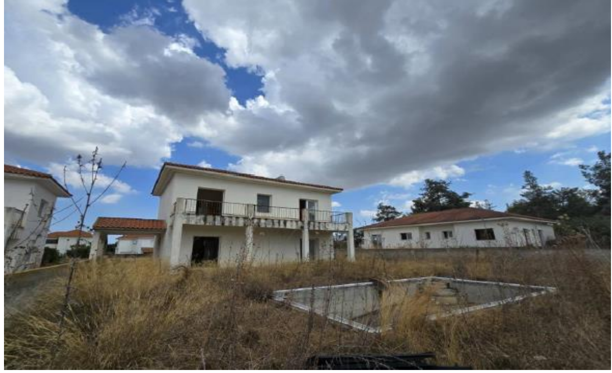
BANK OF CYPRUS PUBLIC COMPANY LTD (BOC) has made every reasonable effort to confirm and/or verify the information in this document. It is noted, however, that (a) this information was obtained from public records and/or third parties without the possibility of confirming their accuracy; and (b) BOC neither has possession nor is the owner of the property for sale, therefore the details in this document are provided solely for information purposes, without assuming any responsibility and/or duty and/or obligation by BOC to any person who may become aware of them. BOC strongly urges and/or strongly suggests that, with the help of specialized consultants of their choice, any Interested Buyers, conducts their own investigations and/or on-site examination of the property for sale to verify and/or obtain personal knowledge of all information and data that may affect the decision to participate in the upcoming auction of the property for sale